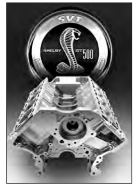
The new all-aluminum engine block manufactured by Honsel uses Ford's patented plasma transferred wire arc (PTWA) cylinder liner technology to reduce weight and increase efficiency.

hermal spray technology was invented in the late 1800s to restore worn metal parts and provide surface protection. Initially known as "metallizing," it became more popular during World War II for fast repair of tanks